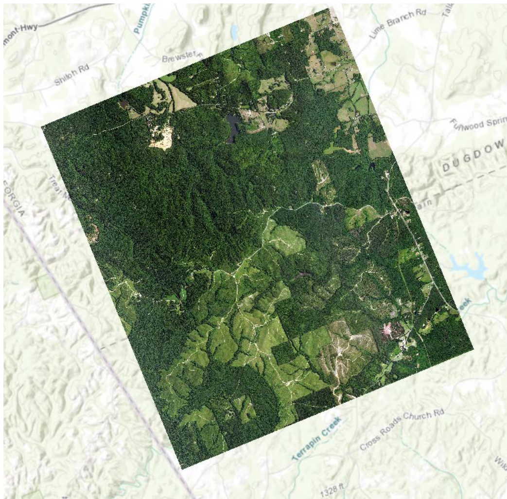
Figure 2 (Original Raster)